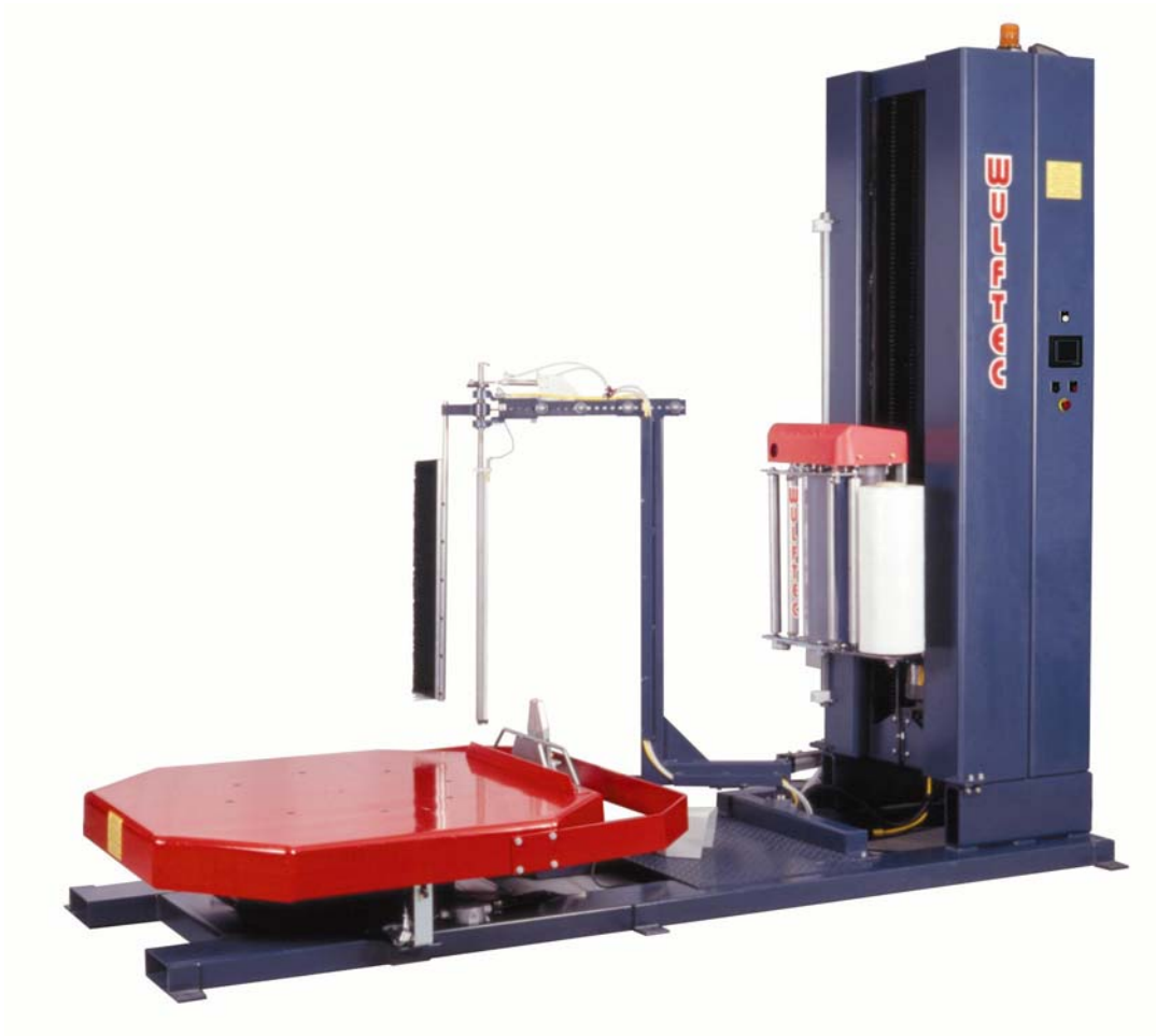
MODEL WHPA-300 8,000 lb. Capacity HEAVY DUTY RING GEAR DRIVEN PORTABLE AUTOMATIC TURNTABLE (WITH NO-THREAD ® POWERED PRE-STRETCH CARRIAGE)