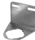
Regulator mounting bracket (Part No. 071982).