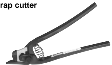
Model 2 Part No. 006630 Cuts tightly imbedded strap. For use with heavier grades of plastic strapping.